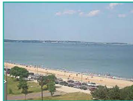
Revere Beach America's First Public Beach

$20.00 to Walk, Run or Roll Pledges Accepted